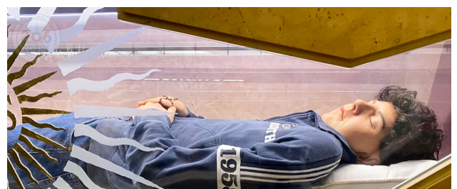
The glass tomb of St. Carlo in the St. Francis Basilica, Assisi.