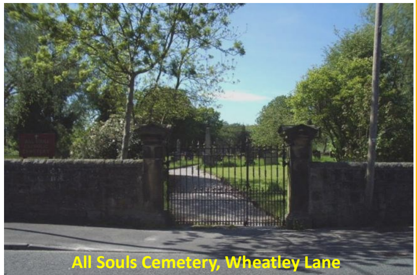
All Souls Cemetery, Wheatley Lane