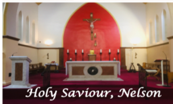
Holy Saviour, Nelson