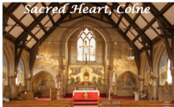
Sacred Heart, Colne