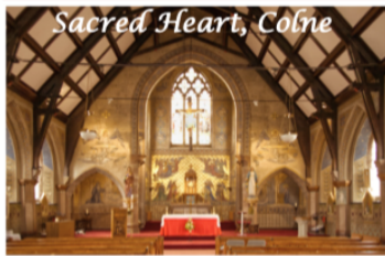
Sacred Heart, Colne