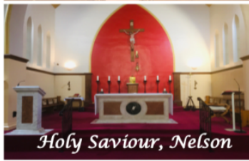
Holy Saviour, Nelson