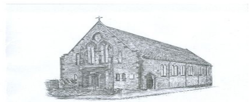
Sacred Heart Church, Colne